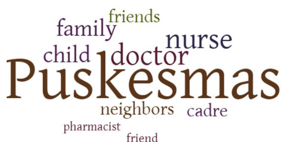
Figure 2. Word Cloud Analysis Results Based on patient statements. Puskesmas is abbreviation for Pusat Kesehatan Masyarakat (Community Health Center)

All patients gave different statements related to treatment adherence. Regarding the interpersonal aspect, various statements that arise from the results of in-depth interviews with patients can be made a word cloud that can be an interpretation model in seeing various sources of motivation for treatment in patients with type 2 diabetes mellitus. The description of the source of patient motivation in taking medication can be seen in Figure 2.