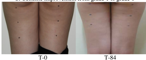
Figure 1. Photographs Showing the Improvement in the Cellulite Before (T-0) and After (T-84) the Treatment