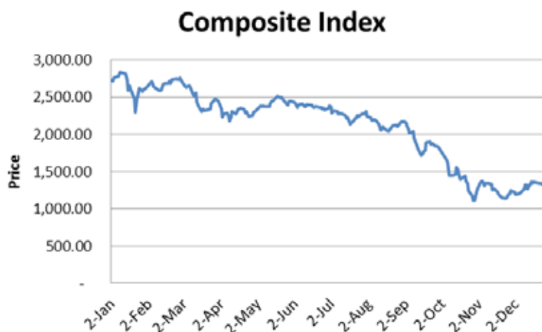
Figure 3 Graph of Jakarta Composite Index in 2008

Test on information asymmetry indicates that information asymmetry is less likely to affect return dispersion. However, the most interesting result of this study is the impact of information asymmetry on herding behavior. In particular, when there is asymmetric information, investors tend to follow the crowds, i.e the higher the information asymmetry, investors are more likely to ignore their private information and choose to follow market consensus. Without considering information asymmetry, this study found no