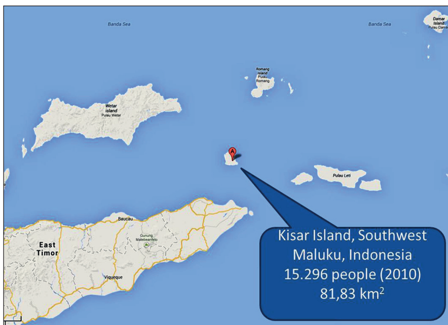
Map 1. Southwest Maluku, Indonesia.

Woirata (Kisar Island, Southwest Maluku, see Maps 1 and 2) is closely related to Fataluku (Timor-Leste) and belongs to the East Timor subgroup of the Timor-Alor-Pantar language family (TAP) together with Makalero and Makasai (Schapper, Huber, and Van Engelenhoven 2012). It has about 1,566 speakers. From a historical point of view it features many characteristics which corroborate that Woirata is linked through Proto Timor-Alor-Pantar to the Trans New Guinea Phylum, for example, the alveolar retroflex [ʈ] and the glottal stop [ʔ] in its phonology, respectively transcribed here as d and ʼ , the singular-plural distinction in its morphology and its clause-final negation. The other main language spoken on Kisar Island is Meher with more than 10,000 speakers. Apart from on Kisar, Meher is also found on Romang Island and in Kisar settlements throughout Indonesia, as for example on Wetar Island and in Ambon, Kupang and Jakarta. This language belongs to the Luangic-Kisaric branch of the Central Malayo-Polynesian branch of Austronesian (Van Engelenhoven 2009a).