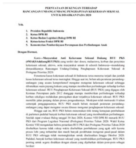
Figure 2. Statements Support for the bill draft on the ESV

Various ways have been taken so that the problem of sexual abuse in Indonesia can be resolved immediately and thus, reduce the perpetrators of sexual harassment and discriminatory towards minorities. Meanwhile, the community and the NGO support to process the ratification of the bill draft on the ESV using the method of social media, print media, and