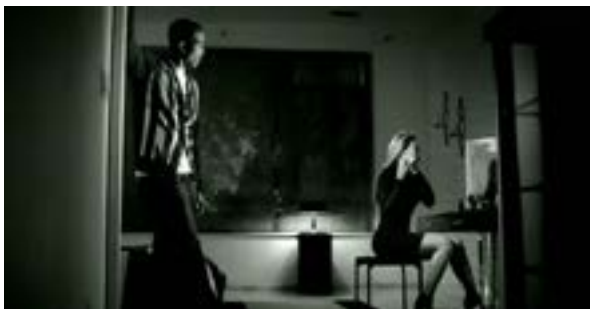
Picture 1. Beyonce is facing the mirror while putting off her earrings (00:03:38)