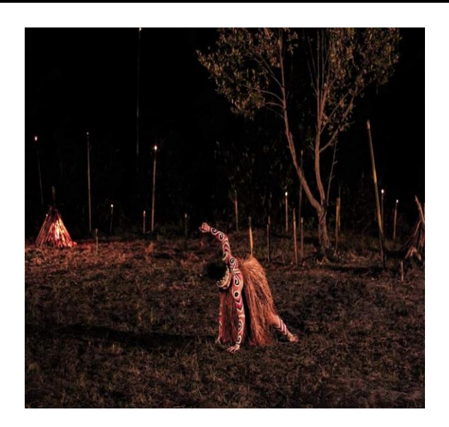
Figure 5: Dancer uniting with the senses and Kamoro spirit.