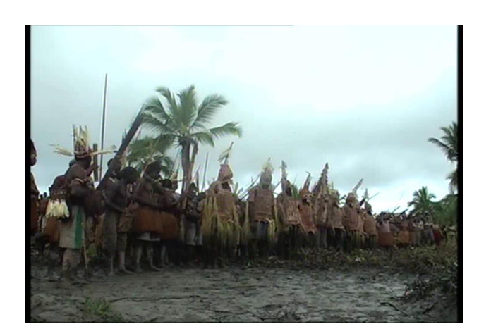
Figure 2 : Scene of farewell to the setan by the Biapis villagers.

the setan objects such as sanapi sticks from wood, mud, wheat, gepe-gepe , Then there is playing catch by the children chased by the setan. The closing scene of Ipai is the letting go of the Spirit with a farewell speech and mantra chanted by one person trusted by the chief of the Biapis village, and chosen to be the next chief. The other dancers stand in a straight line with community spectators behind the demon.