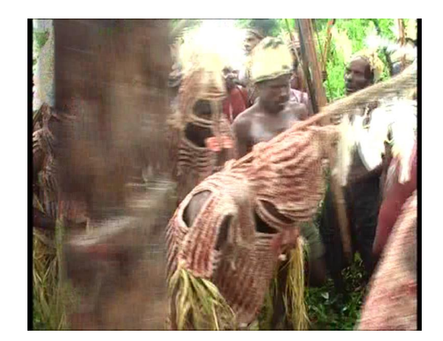
Figure 1 capturing the demon in hiding.

The chieftain of the tribal council leads the way to meet and capture the demon setan in hiding.