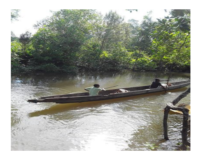
Figure 3: sampan boat near the performance site.

With the sampan boat, the Kamoro tribe can overcome life problems such as;Economic Needs,Social Needs, Religious Needs. The Sampan is so important for the Kamoro tribe. Sampan has quite extensive functions and roles, namely as a symbol of life force, as a traditional means of transportation from one village to another, and from city to village or vice versa. With the existence of the sampan , the Kamoro people find it easier to make a living for their daily lives.