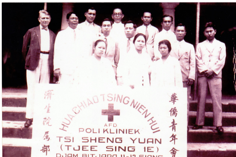
Picture 6. Doctors and nurses who served for Tsi Sheng Yuan, a small clinic which established by HCTNH (Tionghoa Youth Association).