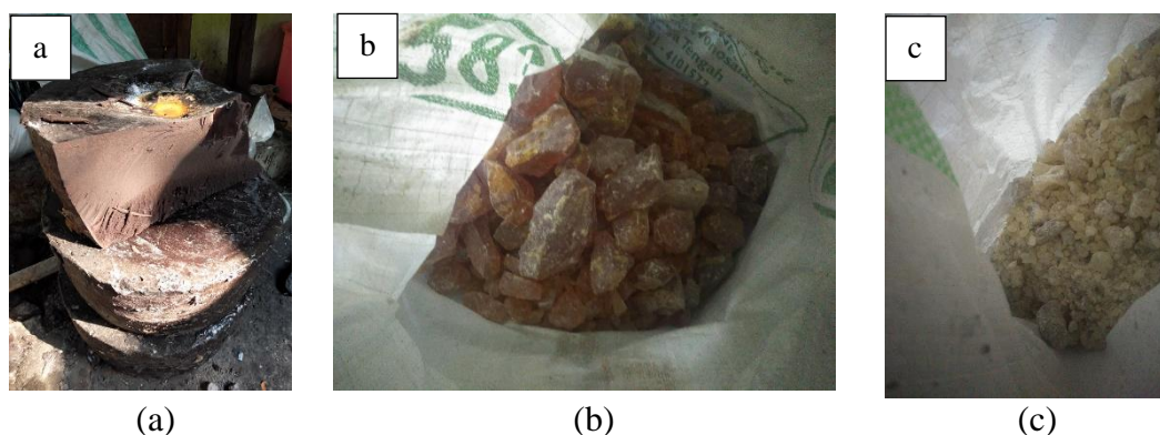
Figure. 2 The recovered wax (a), rosin (b), and cat's eye resin for wax recycling

This study discovered that waxes were usually recollected in a vessel with a 49 cm diameter and 20 cm height (Figure 2a), equaling 37,695.70 \text{ cm}^3 . When the volume is multiplied by the recovered density of 0.90 \text{ g/cm}^3 (Widianarko & Pratiwi, 2020), the wax recollected is 33,926.13 g or 33.93 kg. Furthermore, the interview conducted for the batik workers indicated that to recycle 80 kg of waxes, 7 kg of rosin or colophony (Figure 2b), 2 kg of paraffin, 2 kg of cat's eye resin extracted from Shorea javanica , and 2 kg of micro wax were added (Figure 2c). This differed from the previous study because the wax was usually recollected, cleaned from trashes, and reused directly in other batik SMEs. Nevertheless, it indicates that the home industry has been recycling waxes instead of recollecting them.