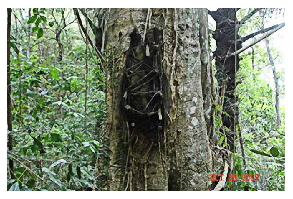
Figure 8. Baby tree in which Tato' Dena' buried his 3-months-old grandson just two years before. It is the same tree in which he buried his daughter decades before (photograph by the first author, 2007).

Figure 7. Tato' Dena' shows Stanislaus Sandarupa the site where the urn of a stillborn was recently placed (photograph by the first author, 2007).