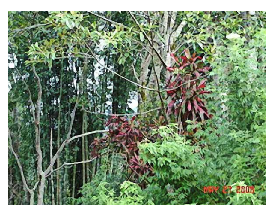
Figure 4. Location at the entrance of hamlet Pongbembe where body fluids from the deceased are dripped into the soil. Vegetation is promoted as trees and the colourful Tabang plants testify.