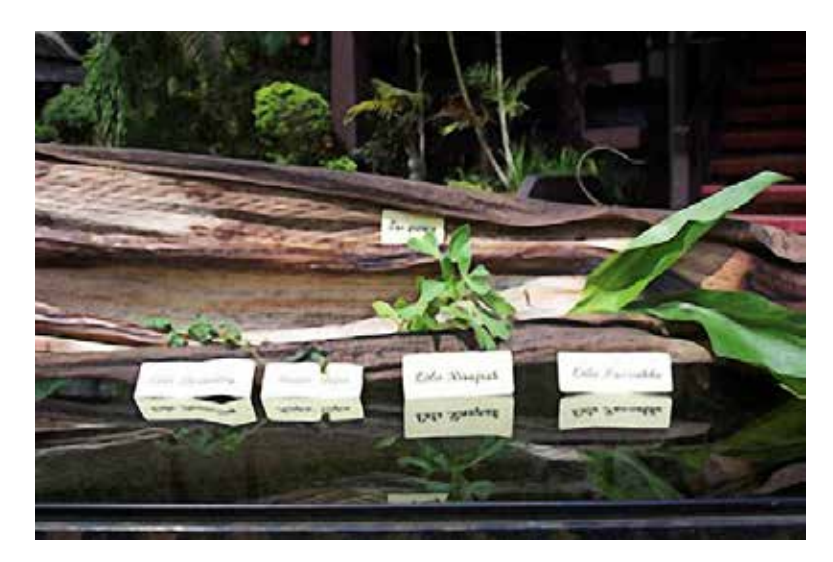
Figure 6. The small plants ( Lolo daringing, rapa rapa, lolo rapang and lolo passake ) each with their roots are planted on the gravesite (photograph by the first author, 2009).

Figure 5. Burial location of the placenta (photograph by the first author, 2006).