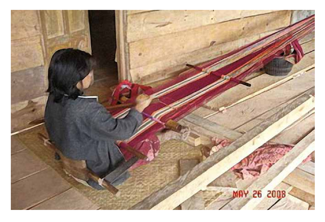
Figure 3. Weaver of traditional material in Pongbembe.

As an anthropologist, Stanislauss Sandarupa had spent a number of seasons in Pongbembe to document how people live in this remote area. He took me on a hike to one of the highest dwellings from where the entire countryside can be seen. The foreground of the view, interrupted occasionally by a scarecrow, was made up of bright green rice paddies where plants gently waved in the breeze. In the far-distance, craggy mountains rose, still covered with forests, though there was some evidence of slash and burn activity. Small hamlets with no more than 20-40 families dotted the mountainside.