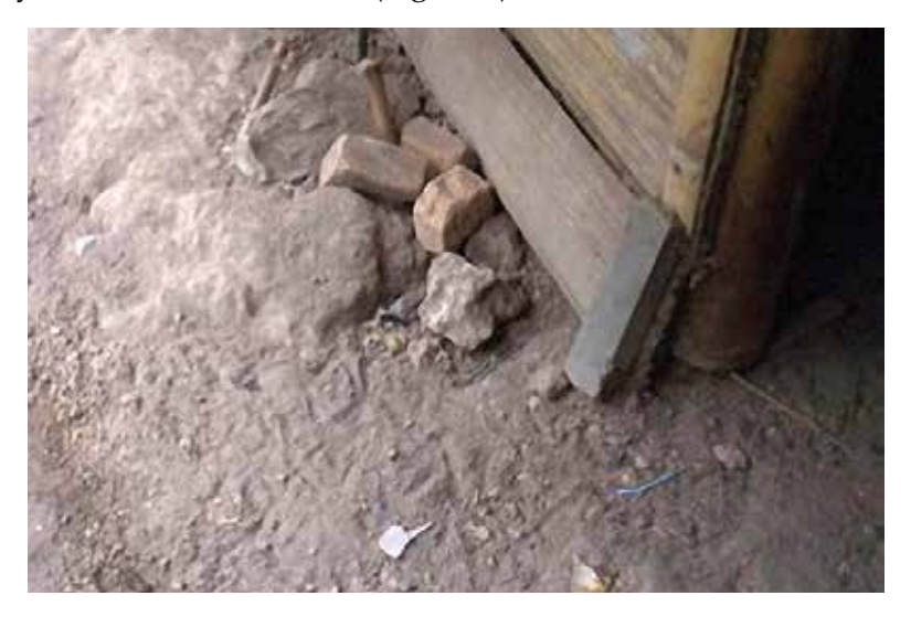
Figure 5. Burial location of the placenta.

The placenta is buried with a kapipe (a small bag woven of reeds) that contains yellow rice and manik riri (three tiny yellow beads) so that it will be quietly satisfied in its burial place under the house. The burial site is often set apart by stones or a small fence (Figure 5).<sup>48</sup>