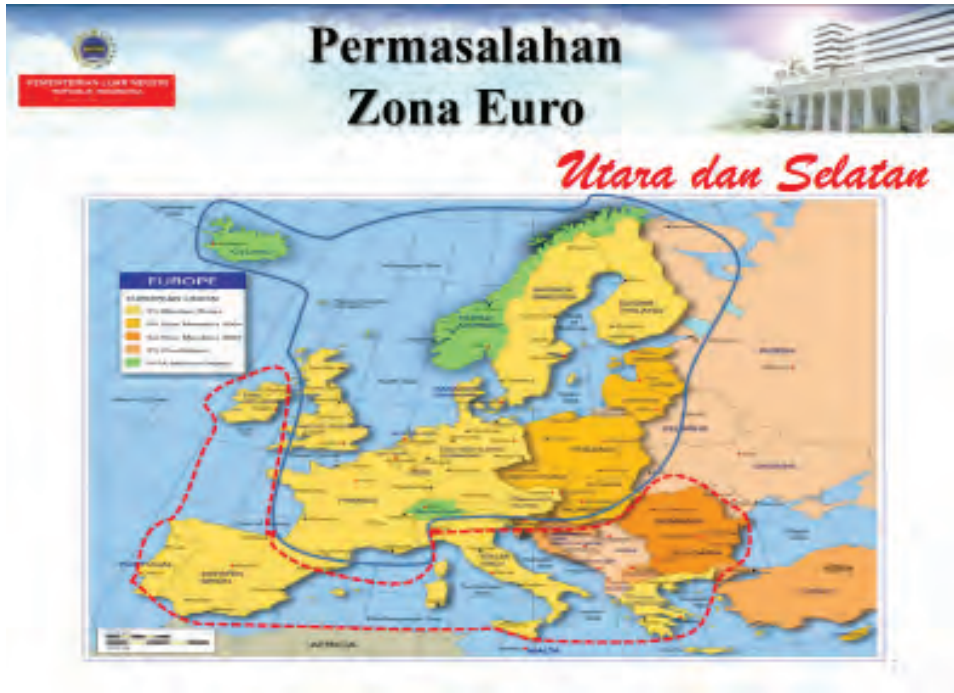
Figure 3: Euro Zone Issue - North and South