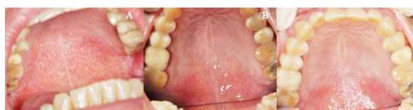
Figure 1. (A) Reticular and erythematous lesions on the palate in a 56-year-old male erupted after taking simvastatin and amlodipine for 7–8 months before treatment. (B) Improvement shown after stopping simvastatin and treating the lesions with triamcinolone acetonide 0.1% mouthwash for 3 weeks. (C) The palatal lesion resolved 7 months after treatment.