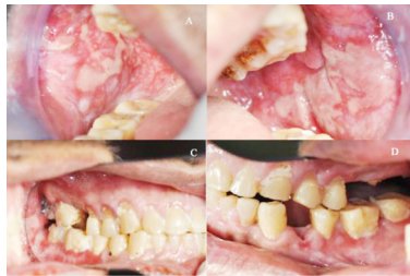
Figure 2. (A–D) Severe oral lichenoid drug reaction in a 62-year-old patient with a history of hypertension, stroke, dyslipidemia, and epilepsy who was taking amlodipine, simvastatin, acetylsalicylic acid, and clopidogrel. Poor oral hygiene and generalized severe ulceration, white striae, and erosion with a pseudomembranous cover can be seen.