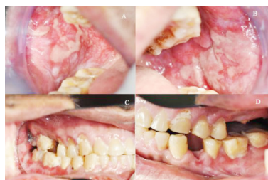
Figure 2. (A–D) Severe oral lichenoid drug reaction in a 62-year-old patient with a history of hypertension, stroke, dyslipidemia, and epilepsy who was taking amlodipine, simvastatin, acetylsalicylic acid, and clopidogrel. Poor oral hygiene and generalized severe ulceration, white striae, and erosion with a pseudomembranous cover can be seen.