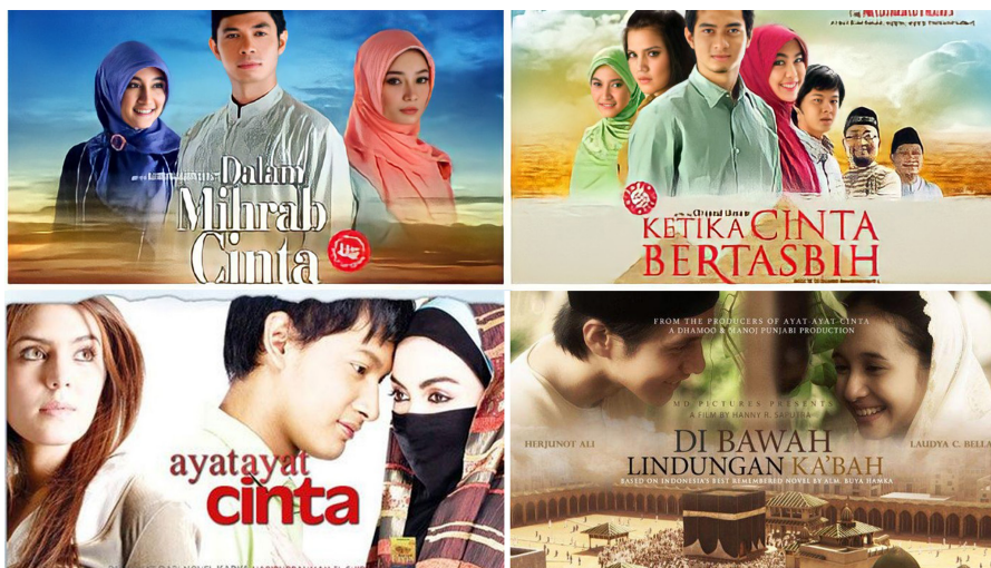
Image 5. Indonesian films containing Arabic words.