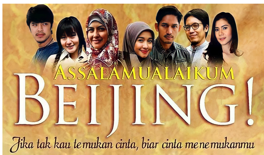
Image 6. Assalamualaikum Beijing . (Retrieved from: https://jadiberita.com/58958/film-assalamualaikum-beijing-ditayangkan-di-jepang.html ).