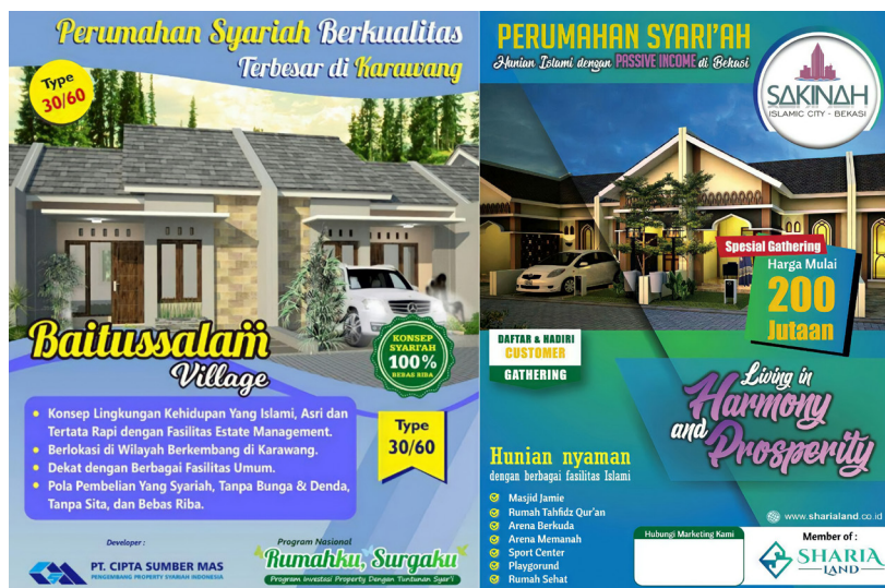
Image 3. Promotional posters. (Retrieved from: www.perumahansyariahku.com ).

Arabization and Islamization can also be observed in the lifestyle choices of Indonesian Muslims, particularly in the phenomenon of sharia' housing. Sharia' housing refers to a type of property whose conveyancing system is implemented in accordance with the sharia', particularly in the sense that the ownership scheme is run according to the precepts of Islam. These new Indonesian trends in business and Muslim lifestyles are expressed in a number of Arabic terms, targeting people in search of new alternatives in their choice of housing and/or properties in an environment which approaches Islamic norms as closely as possible (see Image 3).