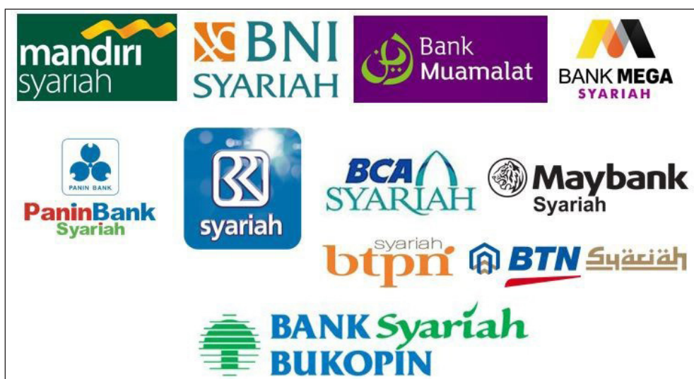
Image 4. Islamic financial systems in Indonesia carrying the Arabic word syariah .

businesses on sharia' principles. Commercial banks which use the word syariah on their logo include PT Bank Muamalat Indonesia, PT Bank Victoria Syariah, Bank BRI Syariah, Bank BNI Syariah, Bank Syariah Mandiri, Bank Syariah Mega Indonesia, Bank Panin Syariah, PT BCA Syariah, and many more (see Image 4). These banks use various Arabic terms denoting Islamic legal principles which are regulated by fatwas issued by the Indonesian Council of Ulama, including ' adl wa tawazun ' 'justice and balance' (< ' ādī wa tawāzun '), alamiyah ' 'universalism' (< ' alāmiyya '), gharar ' 'fraud', haram ' 'prohibited' (< ' ḥarām '), maslahah ' 'benefit' (< ' maṣlaḥa '), maysir ' 'gambling', riba ' 'usury' (< ' ribā '), and zalim ' 'cruel' (< ' zālim '). The implementation of sharia' banking and the supervision of prudential principles and good governance is the task of the Indonesian Financial Services Authority (Otoritas Jasa Keuangan), as is the case with conventional banking, with adjustments to the specific requirements of sharia' banking.