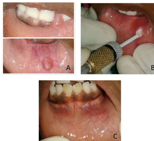
Figure 2. Clinical appearance of the patient in Case 2. (A) Mucocele on the left side of the lower lip which was related to the sucking habit. (B) Cryosurgery was done on the mucocele, showing the white frozen appearance. (C) Clinical appearance four weeks after cryosurgery.

A 9 year old male patient reported to the Department of Pediatric Dentistry and Preventive Dentistry with a chief complaint of painless swelling on the left side of lower lip (Figure 1A). Patient noticed the swelling two months back which increased in size with passage of time, to the present size (2cm x 2cm). The patient had a lip biting habit and his medical, dental and family history was not contributory. There was history of bursting of the swelling which recurred after few days. On examination, a well circumscribed, transparent, slight bluish coloured, swelling was seen. The swelling was flaccid and, painless, with a smooth surface. A provisional diagnosis of mucocele of lower lip was made and surgical excision of the mucocele was planned (Figure 1B). Blood investigations of the patient were within normal limits. Surgical excision of the mucocele was done under local anesthesia after obtaining informed and written consent from the patient's parents. The specimen was sent for histopathological