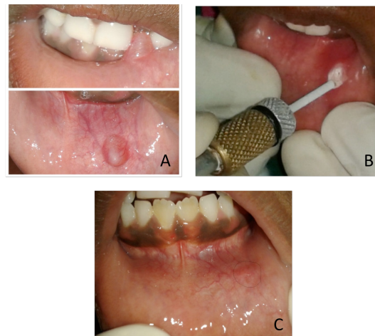
Figure 2. Clinical appearance of the patient in Case 2. (A) Mucocele on the left side of the lower lip which was related to the sucking habit. (B) Cryosurgery was done on the mucocele, showing the white frozen appearance. (C) Clinical appearance four weeks after cryosurgery.

A 9 year old male patient reported to the Department of Pediatric Dentistry and Preventive Dentistry with a chief complaint of painless swelling on the left side of lower lip (Figure 1A). Patient noticed the swelling two months back which increased in size with passage of time, to the present size (2cm x 2cm). The patient had a lip biting habit and his medical, dental and family history was not contributory. There was history of bursting of the swelling which recurred after few days. On examination, a well circumscribed, transparent, slight bluish coloured, swelling was seen. The swelling was flaccid and, painless, with a smooth surface. A provisional diagnosis of mucocele of lower lip was made and surgical excision of the mucocele was planned (Figure 1B). Blood investigations of the patient were within normal limits. Surgical excision of the mucocele was done under local anesthesia after obtaining informed and written consent from the patient's parents. The specimen was sent for histopathological