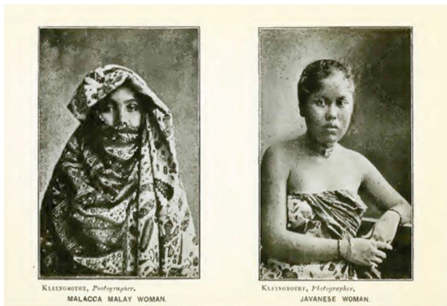
Picture 4. Photographs of C.J.'s Kleingrothe as illustration of Illustrated Guide to The Federated Malay States (1910).

The object of illustrations in this book at a glance are the same as those found in the Dutch East Indies' guidebooks Guide to the Dutch East Indies (1897) and Java, the Wonderland (1900), such as landscapes, plantations, mining, activities of people, flora, fauna, and building.