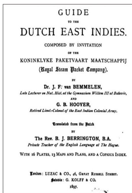
Picture 1. The Title Section of Guide to the Dutch East Indies (1897) by J.F. Van Bemmelen and G.B. Hooyer.

Another interesting point in the introduction is a statement related to the Dutch East Indies government policy on colonies. In the late of the nineteenth century, the Dutch East Indies government began to realize that its colonies were suitable not only for young government employees for a career and spent most of their lives, but also for short visits, whether both business and leisure travel. It was then affirmed that: 'Abroad too, the existence of the Dutch East Indian Colonies, their easy practicability and safety, and, above all, their scientific remarkableness and natural beauty, are, little by little, getting to be known.' (Bemmelen & Hooyer 1897, 4).