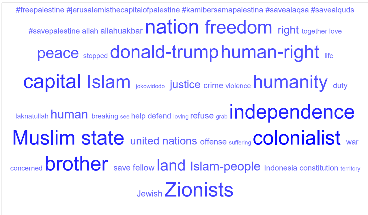
Figure 2. Results of word frequency analysis for all e-petitions

We found that conflict in Palestine seemed to reinforce individuals’ action related to their identity as Muslims. Most of the petition comments indicated that Indonesian Muslims felt a sense of similar religious identity with their Palestinian counterparts. They felt that they shared kinship under their belief in one Allah, as many comments began with “I am Muslim” and continued with phrases such as “brother in faith.” The word frequency analysis also pointed to the role of Muslim identity, as the word “Muslim” was one of the most common words across the 25-e-petitions (see Figure 2). This indicated that the Palestine issue intensified the sense of shared social identity, as Muslims, between Indonesians and Palestinians.