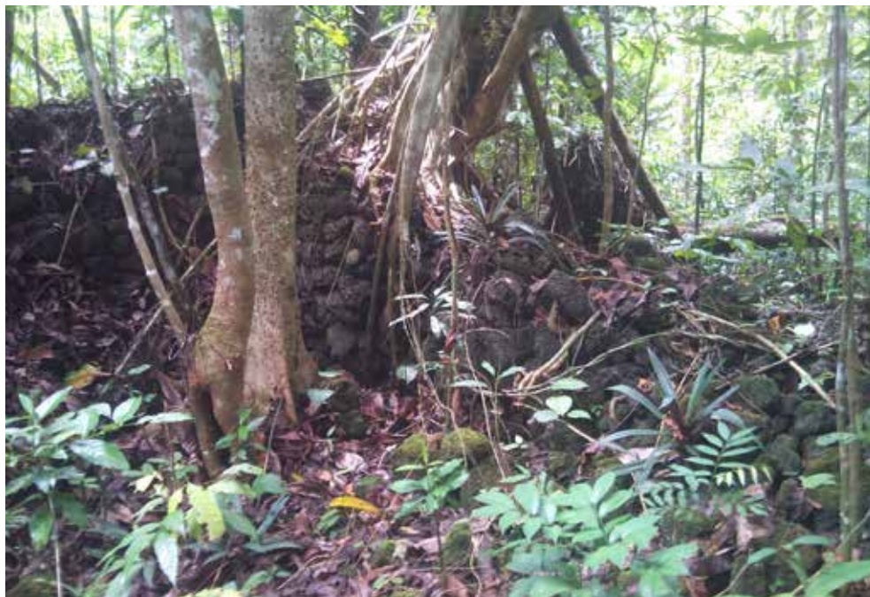
Image 1. Ruins of a stone building in the abandoned village Maiabil on Ujir, said to have been the residence of Tamalola.