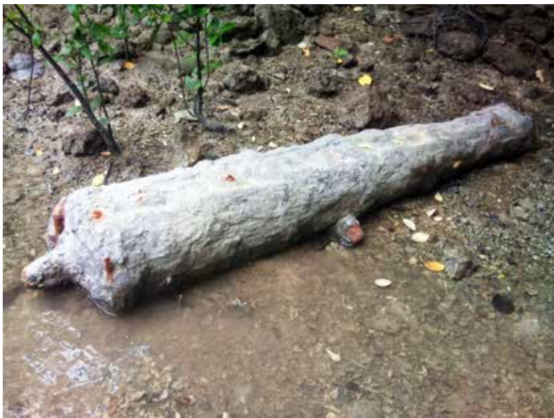
Image 3. A cannon lies buried in mud at the bank of the sungai (natural canal) in Ujir, close to the ruins of the old mosque – presumably the easternmost mosque in the world in the early-modern era.