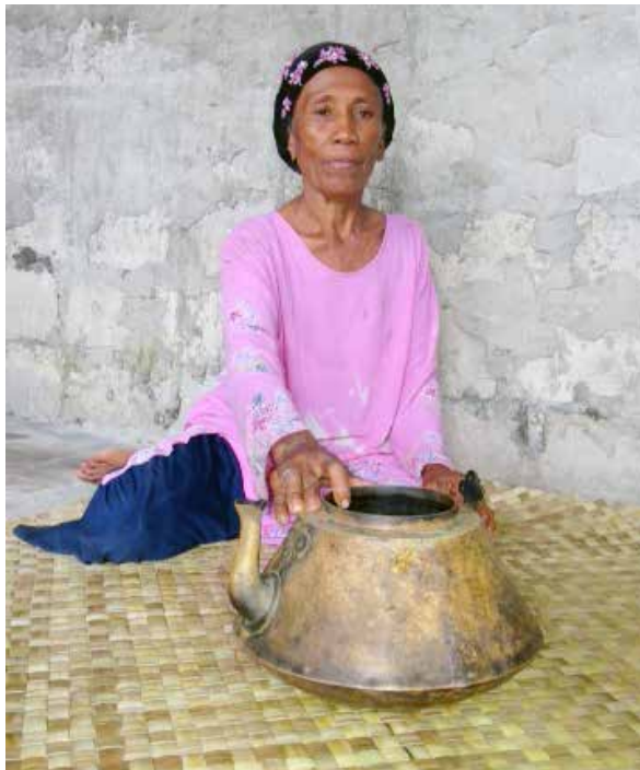
Image 2. A large brass kettle that was, according to tradition, used by Tamalola to serve hot beverages to the people.

In Ujir collective memory, the ancestor Tamalola is remembered as a benevolent ruler who cared for his people and was loved in return. Some of his descendants keep a large brass kettle as an heirloom passed down from him (see Image 2). It is said that the kettle was used to serve hot beverages to the people, while Tamalola himself was served from a silver pot, and that the water in his pot was heated by burning silk cloth – Tamalola was so rich he could use expensive imported textiles instead of firewood. 4