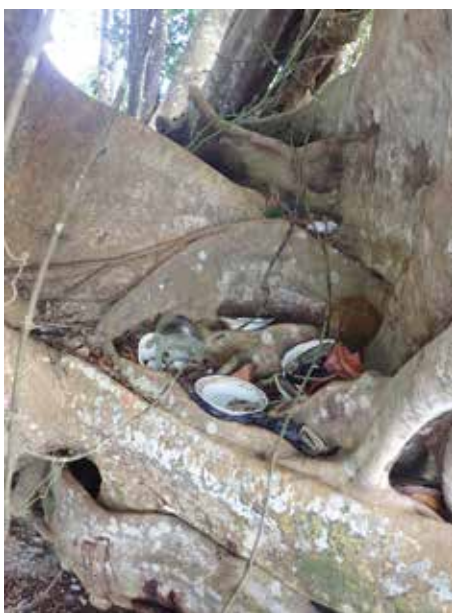
Figure 2. A tempat keramat in the roots of a tree, eastern Pulau Ujir. Note the modern porcelain and glassware.

Similar examples are the modern tradeware plates left at sacred sites ( tempat keramat ) around Pulau Ujir to ask for permission or help from the spirit world. Although not every tempat keramat on Ujir receives offerings of plates, a significant number of them do (Figure 2). The social role of new tradeware in modern Aru is thus far less person-like than that of the Kodi heirloom jars, but its commodity status is not entirely straightforward, in that it is one of a few ritually appropriate gifts to the spirit world. Therefore, in modern Ujir, as elsewhere in Aru, and elsewhere in ISEA, tradeware no longer retains the same social power as it may once have held, but it remains ritually and symbolically important.