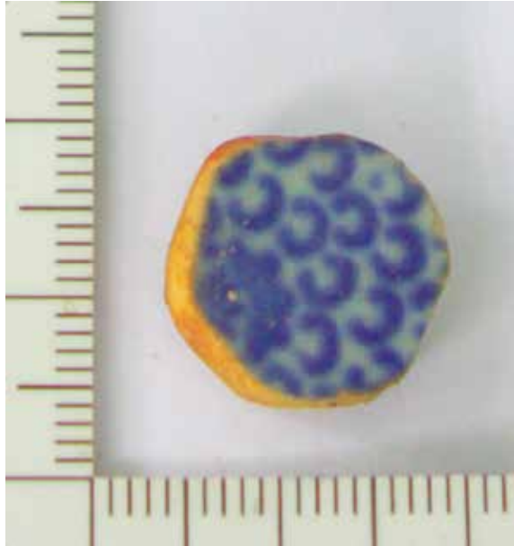
Figure 1. A modified porcelain fragment (courtesy of Joss Whittaker).

small crescent shapes and a floral design in underglaze blue. The reverse face is undecorated white glazed. The edges are unglazed, and appear to have been smoothed by abrasion. The unglazed portions have become yellowish over time, likely due to immersion in water.