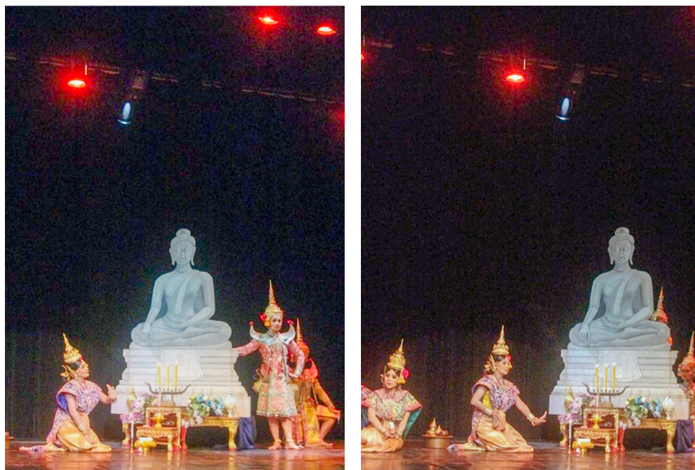
Images 12 and 13. Lakhon Duekdamban Inao depicting the scene of Butsaba and the candle prophecy, 14 staged by the Fine Arts Department at the Thailand Cultural Centre on 4 March 2013, during the SPAFA Seminar and Performances of the Panji/ Inao Traditions held in Bangkok.