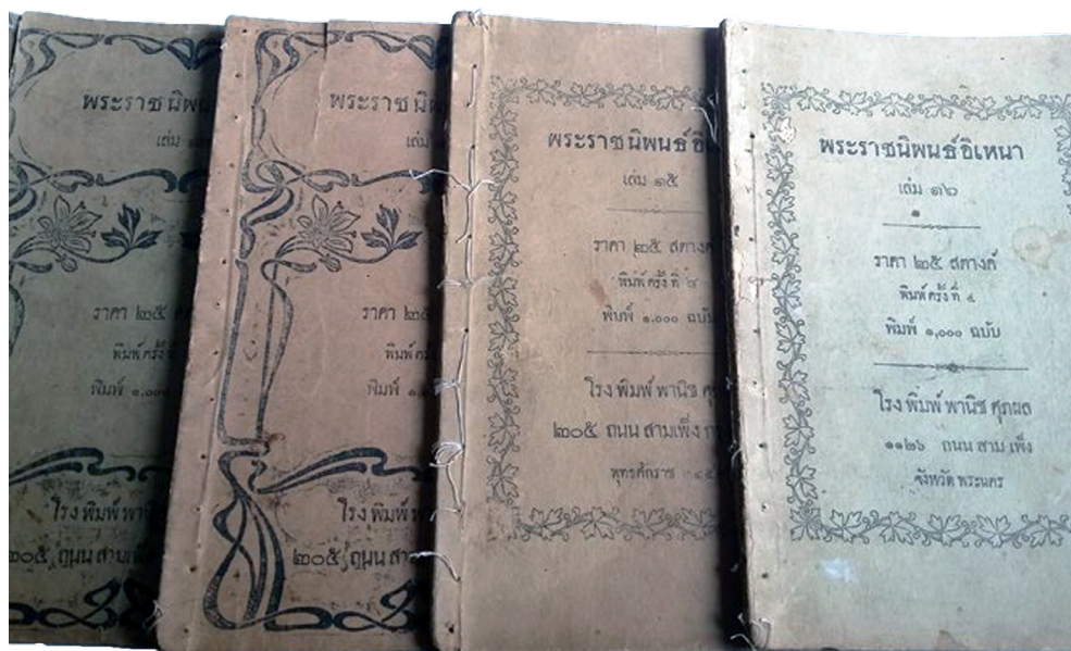
Image 8. An example of some printed books of the Inao of King Rama II, published by the Panitsupphaphon Press during the reign of King Chulalongkorn.

The literary works of this period featuring Inao were composed not only new works composed as shown above, but the classical texts of Inao by King Rama II and Dalang by King Rama I were also first published during that time. The Inao play by King Rama II was first published in 1874 by Dr Samuel John Smith’s Press and subsequently republished many times by other presses during that period, while the Dalang play by King Rama I was first published in 1890 by the Nai Thep Press (see Image 8 for some printed books of the Inao of King Rama II).