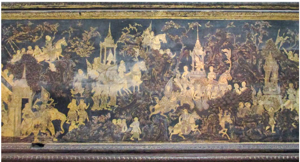
Images 3 and 4. Scenes from the Inao story on a lacquered and painted screen, a court art created during the early Bangkok period (late-eighteenth to mid-nineteenth century), and now kept in the Bangkok National Museum.