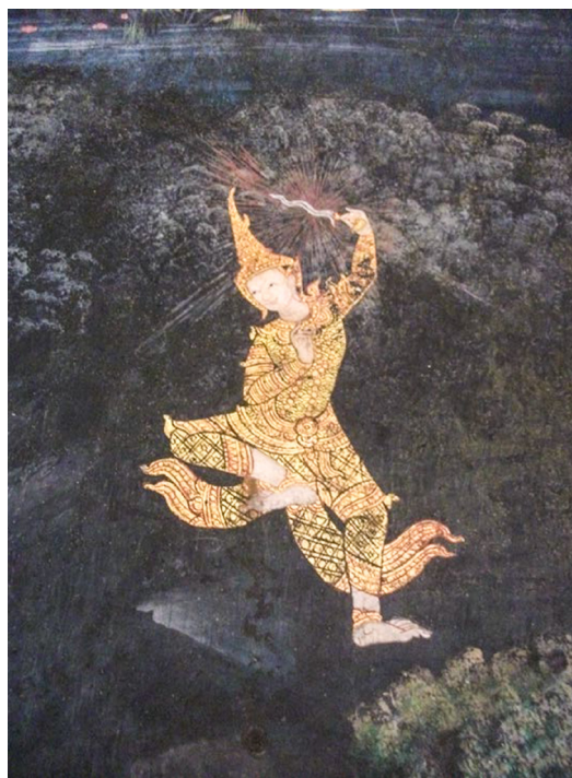
Images 6 and 7. Scenes from the Inao story in the mural paintings in Sommanat Temple created during the reign of King Rama IV. (Photographs by Thaneerat Jatuthasri, 2012).