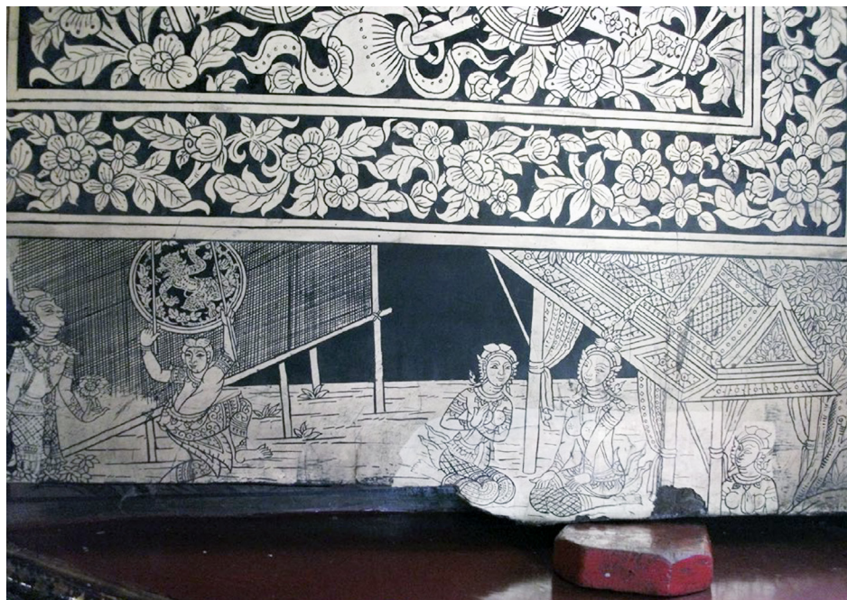
Image 5. Scene from the Inao story on a window in the Hall of the Reclining Buddha in the Phra Chetuphon Temple, created during the reign of King Rama III. (Photograph by Thaneerat Jatuthasri, 2011).

To sum up the context of the creation and the presentation of the Inao during the two sub-periods mentioned above, the Inao has mainly been performed in the royal context and its fame has been principally restricted to royalty and courtiers. However, apart from being mainly performed as Lakhon Nai, the Inao is also presented in other kinds of court art. For example, the story has been sung in He Klom Phra Bantom (a royal lullaby), in Mahori (a traditional Thai ensemble), and in Sakkawa Len Thawai Na Thinang (singing of the Klom Sakkawa verse form in the presence of the King). The Inao story has also inspired court poets to compose many literary works in various genres. Among these works are Inao Khamchan by Chaophraya Phrakhleng (Hon), Nirat Inao by Princess Kamphutchat, Nirat Inao by Sunthonphu, and Lilit Inao by an anonymous poet. In the visual arts, a number of paintings based on the Inao story were created at the behest of the kings or of other members of the royal family. Examples include an Inao painting on a partition wall in the palace of Princess Thepsudawadi, the eldest sister of King Rama I (Damrong Rachanuphap 1965: 106), an Inao painting on a window in the Hall of the Reclining Buddha in Phra Chetuphon Temple created at the behest of King Rama III (Image 5), and the Inao mural paintings at Sommanat Temple created at the behest of King Rama IV in honour of his beloved queen, Queen Sommanat, who loved this story very much (see Images 6 and 7).