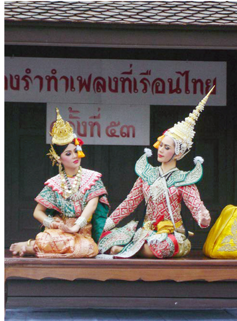
Images 1 and 2. Lakhon Nai Inao performed at Mahidol University in 2009, organized by the Institute of Language and Culture for Rural Development, Mahidol University. (Photograph by Thaneerat Jatuthasri, 2009).