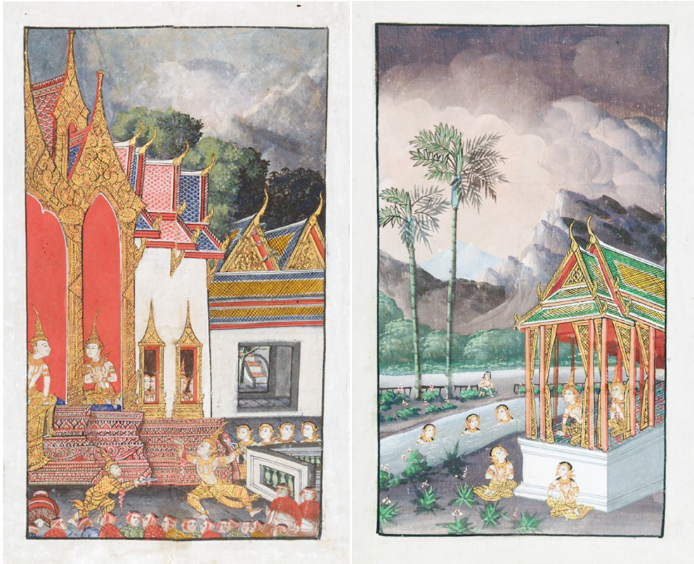
Images 10 and 11. Examples of some Inao paintings by Rot created in 1880. (Samut Ruppaph Rueang Inao, Khoi Book Number 22: 21, 27).

and (iii) Panyi fighting against Yaran, Butsaba's brother, in disguise (Chulasai 2005: 141). After the royal cremation ceremony, these Inao paintings were moved to decorate the wall of the Varobhas Bimarn Residential Hall in the Bang Pa-In Palace.