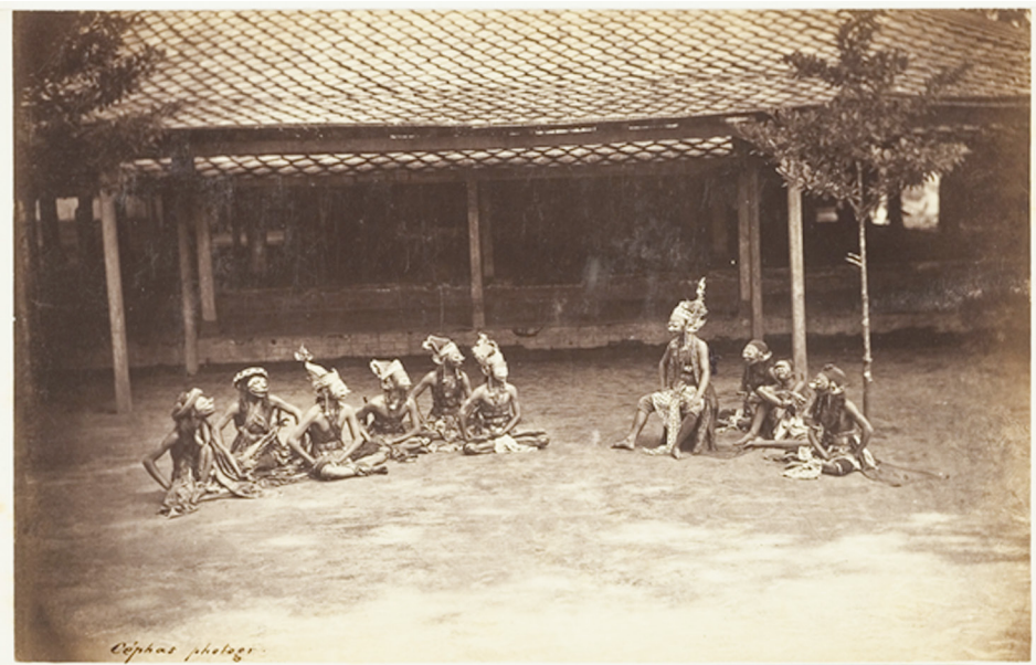
Illustration 3. A masked Klana audience-scene in the palace of Yogyakarta, 1888, photographer Kassian Cephas. (KITLV 3931, courtesy of Leiden University Libraries).

This wayang gedhog script shows that the Kuda Narawangsa play was also known in Yogyakarta, although not necessarily as a masked play. Yet, masked Panji plays must have been performed at the court and residences of noblemen in Yogyakarta, as is evident from the photographs of masked actors of Panji plays by the famous nineteenth century photographer Kassian Cephas (Illustration 3).