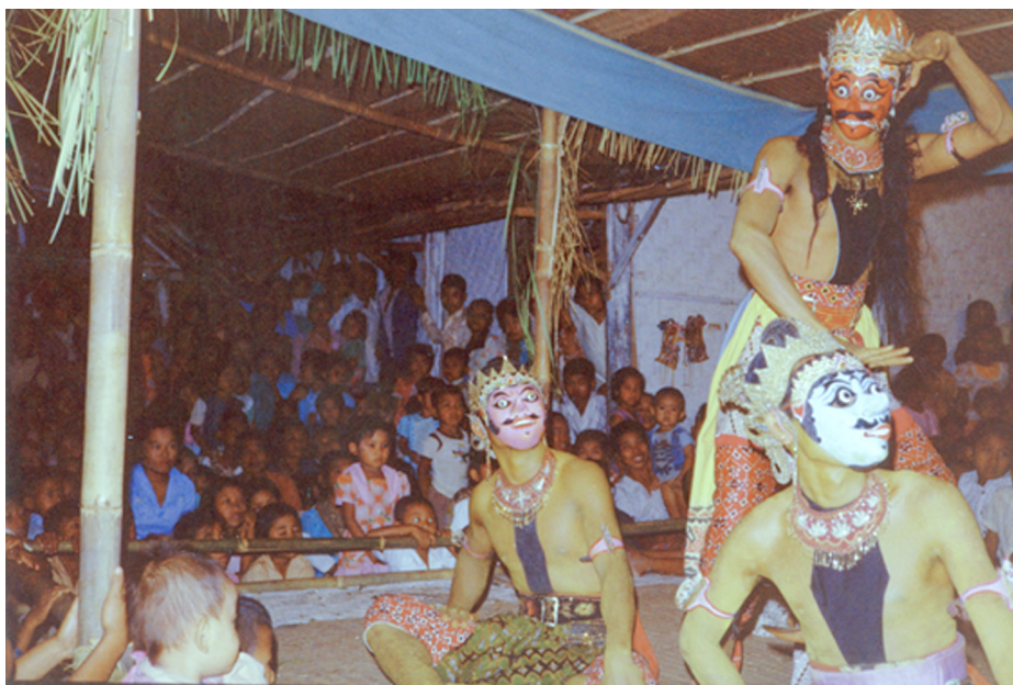
Illustration 1. Scene from “Galuh Candra Kirana murca”, masked play in Ngebrak Semanu, Gunung Kidul, 1977.