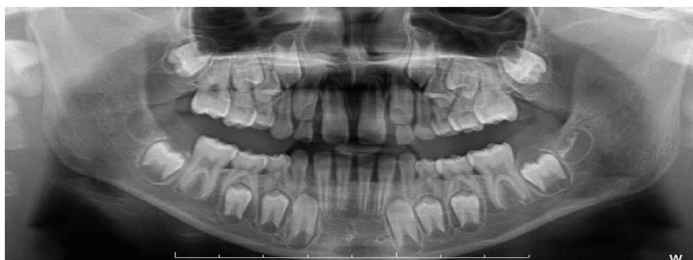
Figure 2: Digital panoramic radiograph showing a boy with a chronological age of 8.66 years