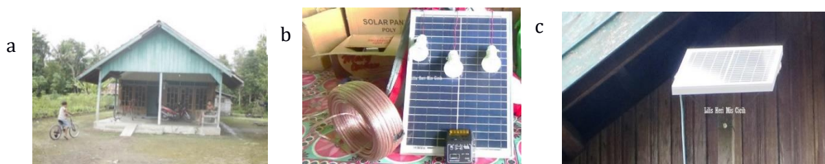
Fig. 3 (a) before installation; (b) micro-scale solar power package; (c) after installation

This community empowerment program providing micro-scale solar power plants reached 100% of its targets. Thus, the total number of beneficiaries was 45 i.e., 43 HHs and two Muslim praying rooms. All the necessary equipment was successfully installed and handed over to the beneficiary HHs. Before the program's provision of micro-scale solar power plants, as many as 63% of the households used electricity from government (installed from their neighbor/not own property). Moreover, 33% of the households used kerosene lamp while 4% used private generators. Figure 3 shows a beneficiary's house before installation (a) and after the installation of a micro-scale solar power plant (c). Figure (b) shows one of these micro-scale solar power packages consisting of the following: a solar cell (20 watts, 12 volts, 2 amperes), 4 LED DC lights (12 volts 5 watts or 4 watts), a solar charge regulator, cables, and a switch tool.