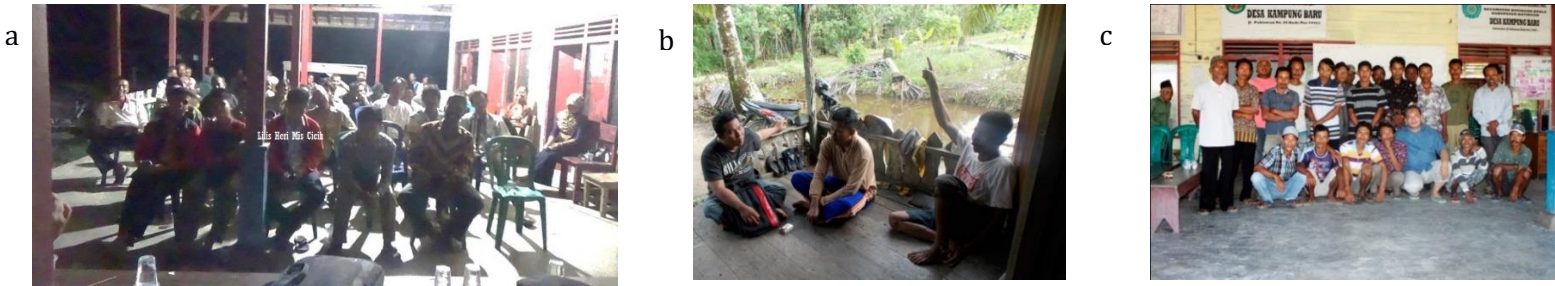
Fig. 2 (a) Meeting with local participants; (b) Socialization program for the rural community; (c) after meeting and discussion