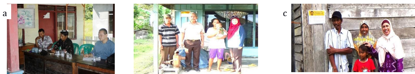
Fig. 4 (a) meeting with household beneficiaries; (b) observation and interview of household beneficiaries; (c) observation and interview of household beneficiaries

As an indicator of beneficiaries' satisfaction, almost all target beneficiaries (98%) gave the answer "very happy" and only 2% said they were "quite happy." This program also benefited 86% of households who engage in non-farming activities as income source, such as tofu processing, bricks, and selling/trade. Figure 4 shows some household beneficiaries who received micro-scale solar power. Figure 4(a) displays a discussion and evaluation activity about the benefits and impacts of micro-scale solar power installation.