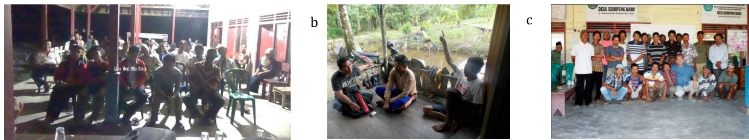
Fig. 2 (a) Meeting with local participants; (b) Socialization program for the rural community; (c) after meeting and discussion