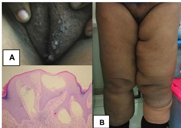
Figure 1. Skin lesions and histopathology pictures of case 1. Multiple discrete verrucous papules and vesicles, lenticular in size on the labia majora (A) accompanied by bilateral lower extremity lymphedema (B). Histopathologic features with hematoxylin and eosin staining (magnification, x10) showing multiple dilated lymphatic vessels of the dermis (C).

denied. She had a history of an enlarged lower abdomen for 15 years.