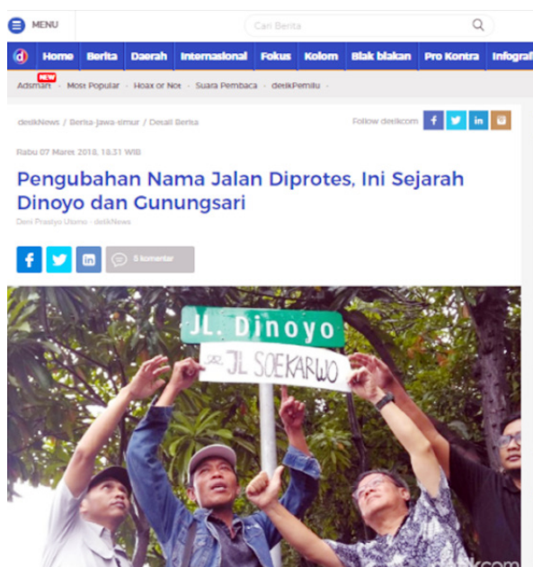
Figure 3. Local Citizens Are Protesting Government's Plan to Rename Jalan Dinoyo in Surabaya.