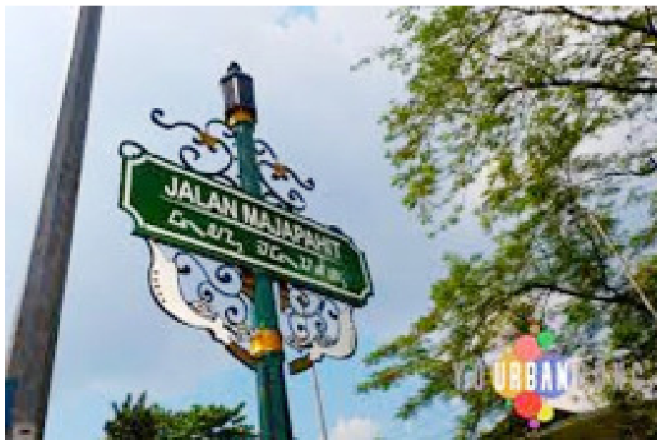
Figure 5. Jalan Majapahit in Sunda Landscape..

the concept of linguistic landscape (LL) on street renaming in Yogyakarta which reflected strong Javanese cultural background. This street renaming was implemented because Keraton Yogyakarta (the Yogyakarta Palace) wished to restrengthen the philosophy of Sangkan Paraning Dumadi represented by the four main roads which stretch southwards from the Tugu monument to Alun-alun Lor (the Palace's Northern Square), starting from Jalan Margo Utomo, Jalan Margo Mulyo, Jalan Malioboro, and Jalan Pangurakan.