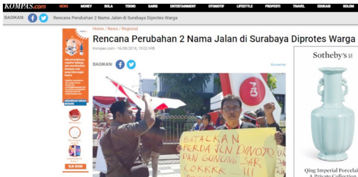
Figure 4. Surabayans Are Protesting Government's Plan to Rename Two Streets.

Local citizens expressed opposition to the government's plan to rename streets because it can remove the cultural and historical values embedded within the old names. Kostanski (2016a) points out four recommendations for the authority which has a plan to rename place names (including street names): (1) the change must be based on a consensus among all relevant and concerned parties; (2) the change must not create controversy, which may lead to protests from the local people; (3) the old and the new names will be used together temporarily before gradually moving to a single name; and (4) the plan must be frequently disseminated among the public using various media outlets.